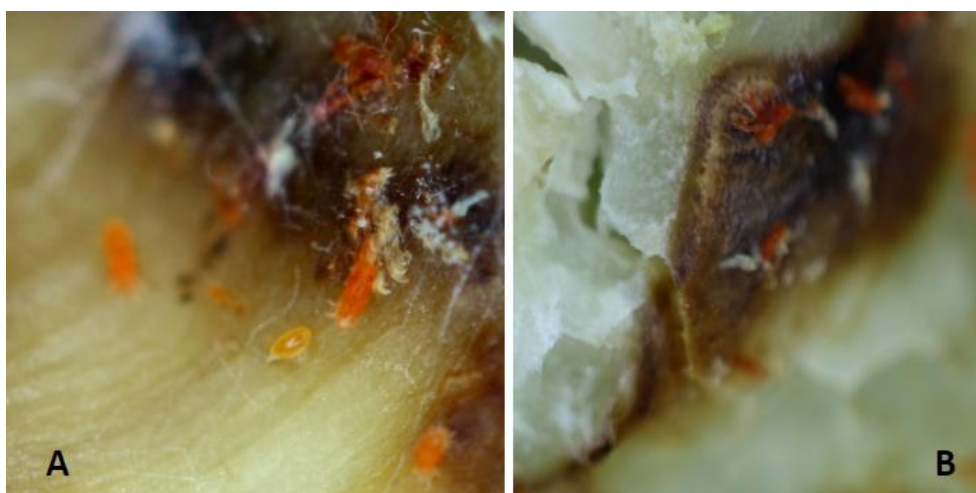
Figure 1. Large number of mites (eggs, immature stages and adults) in the tepal (A), the first symptom of attack (B)

The arecanut palm produces a large number of female flowers in each inflorescence but not all of them develop into mature fruits. Most of the shed nuts show a characteristic reddish discolouration of the area near the perianth. Pineapple mite, D. floridanus (Acarina: Tenuipalpidae) are slender, orange coloured and seen colonized inside the concealed niches of perianth of tender nuts. Feeding imparts a characteristic discolouration to the damaged parts. The mites infestation is noticed extensively in areas around Malappuram in North Kerala. Inner face of the tepals, showed the presence of longitudinal reddish, blister like, deformed corky tissue in the form of irregular and small cracks due to feeding by the mites. Each blotch harboured a large number of mites (eggs, immature stages and adults) Fig. 1A. They were soft bodied and soon desiccated when exposed to bright light. Large sized colonies were found on the affected nuts. It feeds on the sap of the epicarp around the point of attachment of the nut. The first symptom of attack is a brown patch at the base of the young nut at the level of the perianth Fig. 1B. At this stage, when the perianth is lifted up, several aggregation of orange coloured mites, at all stages of development can be seen Fig. 2A. Later these patches enlarge, the epidermis cracks, and occasionally deep fissures develop Fig.2B. Malformation of nuts, or immature nut drop, occurs if the infestation is severe.